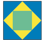
Block Make 16 [64]

On an accurate photocopy machine or by tracing, make 16 [64] copies of the foundation pattern. The block pattern can be downloaded from our web site at www.quiltmaker.com .