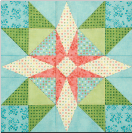
made by Peg Spradlin

Substitute this foundation for the C/D/Dr templates used in Peg Spradlin's Spring Blossom block. Complete directions for Spring Blossom appear in QUILTMAKER'S 100 BLOCKS —Winter '09. If you cannot find this issue at your local quilt shop, order back issues at shopquiltmaker.com .