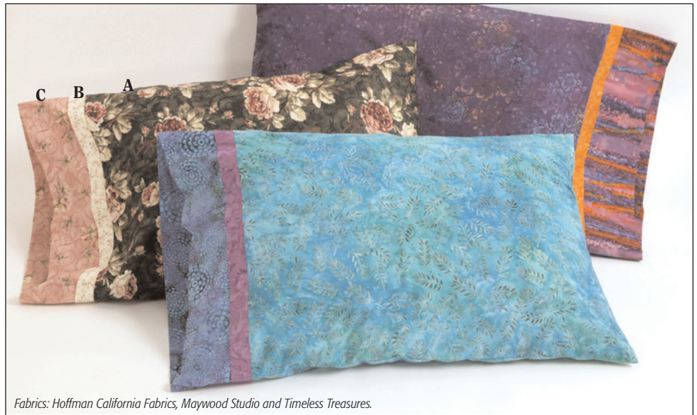
Fabrics: Hoffman California Fabrics, Maywood Studio and Timeless Treasures.